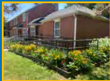
2nd Place Flower Garden Ivan and Nina Otroda