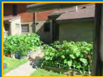
1st Place Vegetable Garden Ganga and Bishnu Chauwan