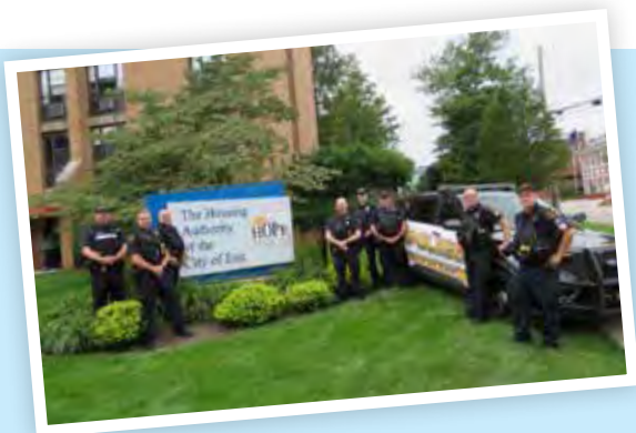
Pictured above, from left to right: