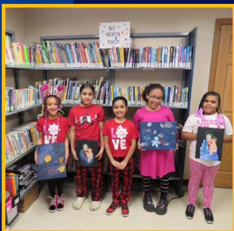
John E. Horan Garden Apartments Dafmark Creative Arts Program

These include the City of Erie Bureau of Police (Community Policing), YMCA of Greater Erie (Youth Recreation), Community Health Net (Dental Services), Early Connections (Licensed Childcare), E.F. Smith Quality of Life Learning Center (Adult Education and Family Support Services), John F. Kennedy Center (Youth and Senior Support Services), SafeNet (Domestic Violence Casework Services), Gannon University Nursing (Health Education) and MCRC (Adult Education and Family Support Services).