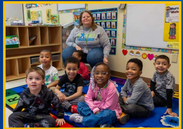
Harbor Homes Early Connections Childcare Program

For the past 25 years HACE has been involved in several community partnerships to assist organizations in trying to improve Erie's underserved communities and populations. HACE spends over $2,000,000 annually to partner with area social service agencies to bring their services on-site.